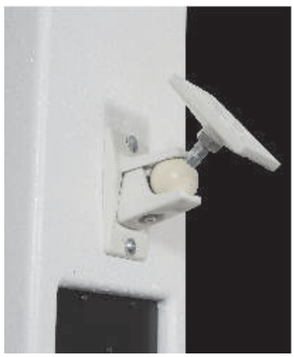
Optional Wall Bracket: Omnimount 20.5 ST-MP

Net weight: 16.3 lbs. (7.39 kg) Shipping weight: lbs. ( kg)