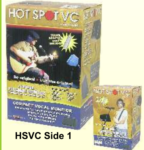
HSVC Side 1

Galaxy Audio has redesigned the art on the Hot Spot VC box. We have upgraded our box to a full color glossy design. Look for our other products to get the updated box look in the near future.