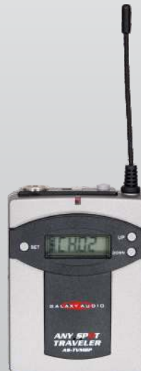
Wireless Body Pack AS-TVMBP