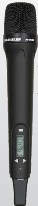
Wireless Handheld AS-TVHH