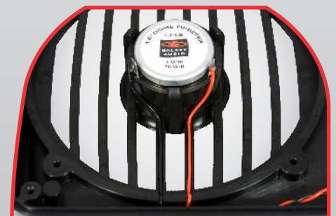
1.5" Titanium Dome Tweeter as mounted from inside the bezel