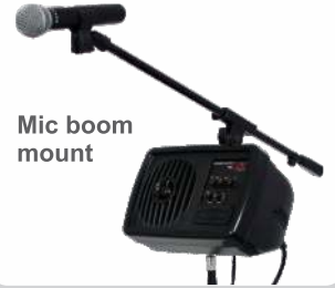
Mic boom mount

With the integrated mounting points multiple mounting positions can be achieved with the optional yoke bracket. Yoke Bracket Part # SA-YBRF