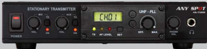
Rack mount or stand alone Transmitter AS-TXRM

to cover a multitude of applications and provide the power to handle nearly any situation. A new amplifier, new 2 way speaker system, lighter weight, more power output, and great built in features make the PA6S the best sounding, lightest, and most powerful compact PA system on the market.