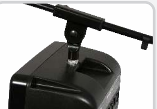
Integrated Mic Boom Socket. Mic boom and hardware sold separately.